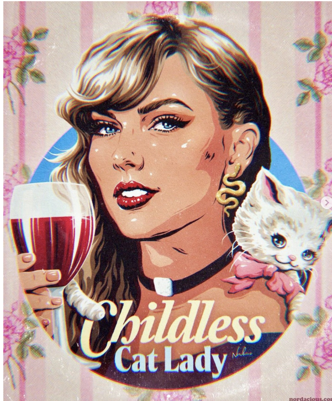
Nordacious Childless Cat Lady Instagram, 25 August 2024

In August 2024 Republican vice-presidential candidate JD Vance called leading Democrats 'a bunch of childless cat ladies'. A month later, Taylor Swift, the world's most famous pop star, posted her endorsement of Democratic presidential candidate Kamala Harris on Instagram, encouraging her fans to register to vote and signing off 'Childless Cat Lady'. Voter registrations spiked after the post.